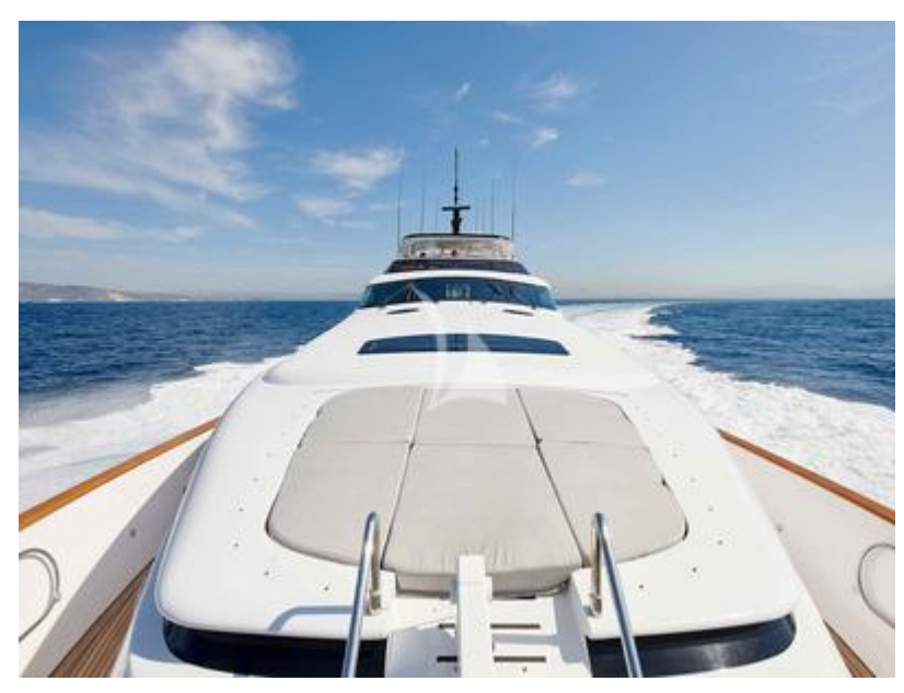
Fore Deck Lounge Area