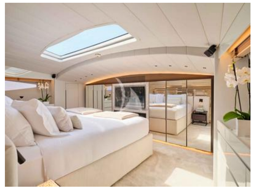
En suite facilities