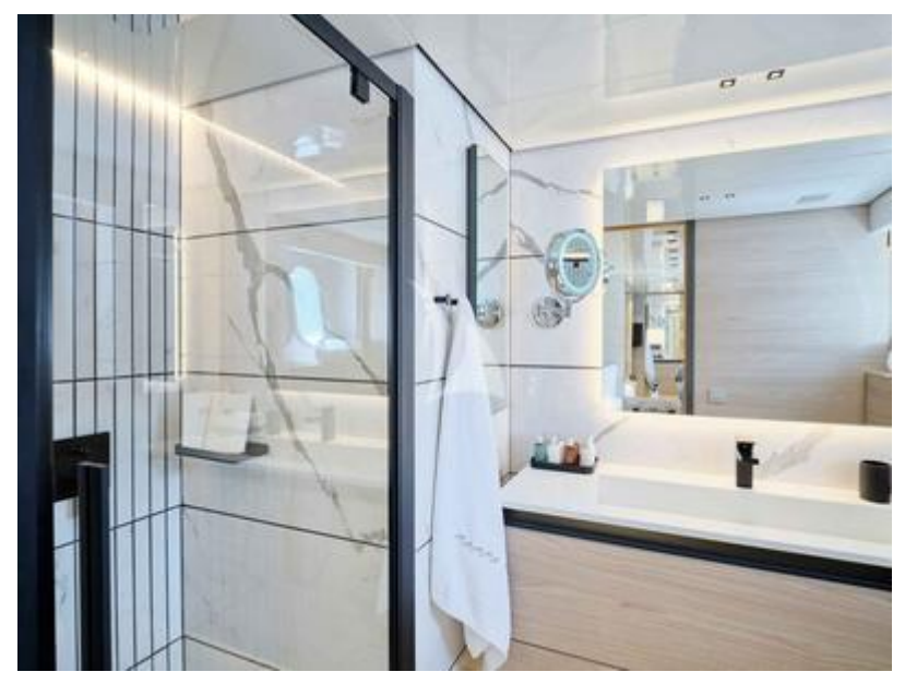
En suite facilities