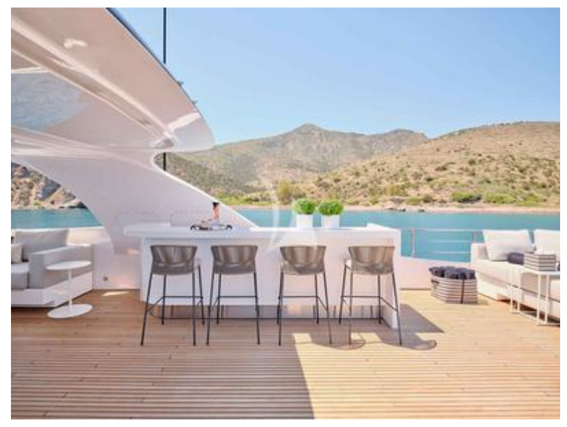
Sun Deck Bar