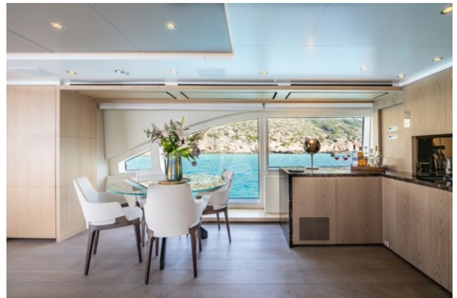
Bridge deck salon port