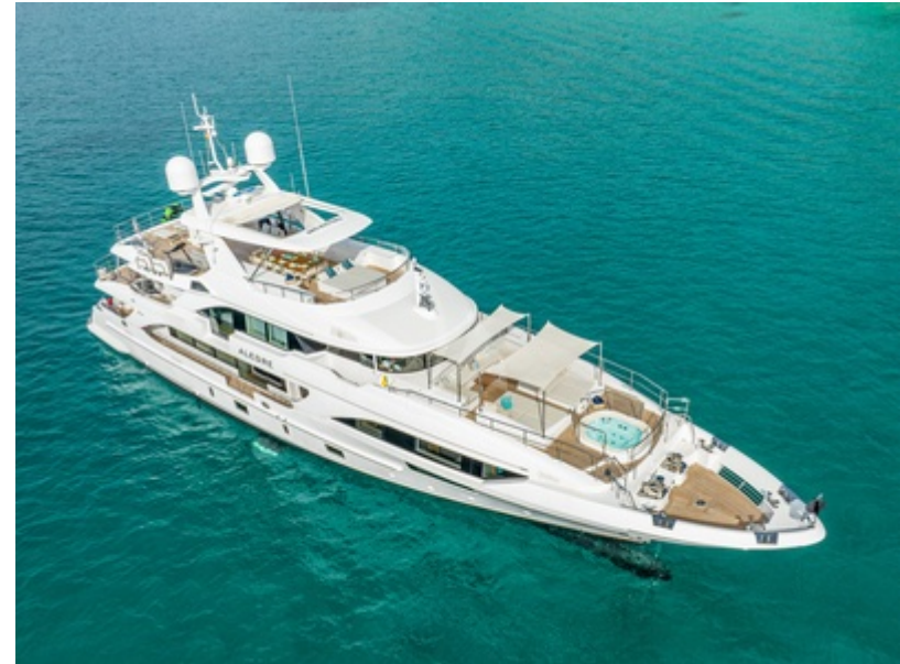
Alegre from above