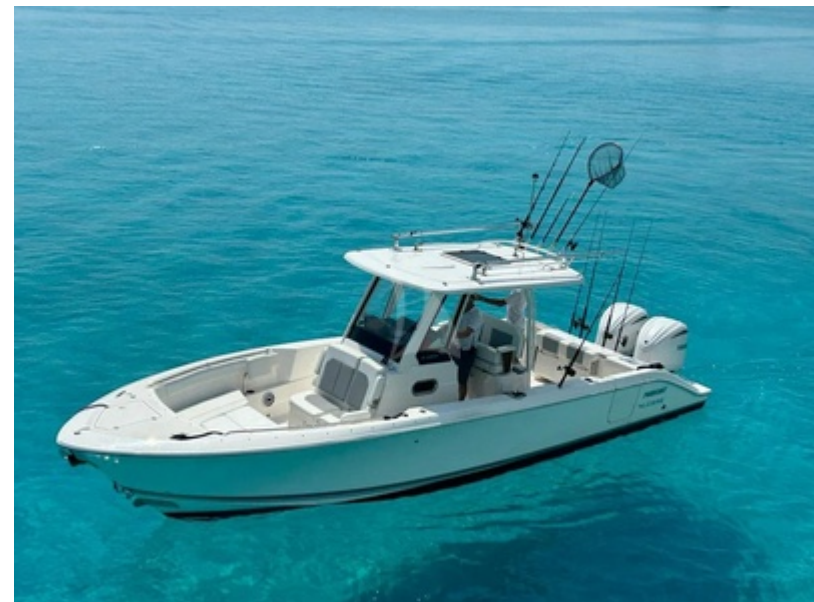
Pursuit 28' tender