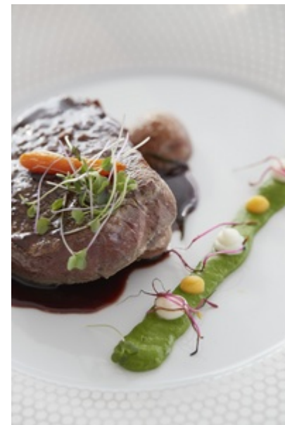
Filet of beef