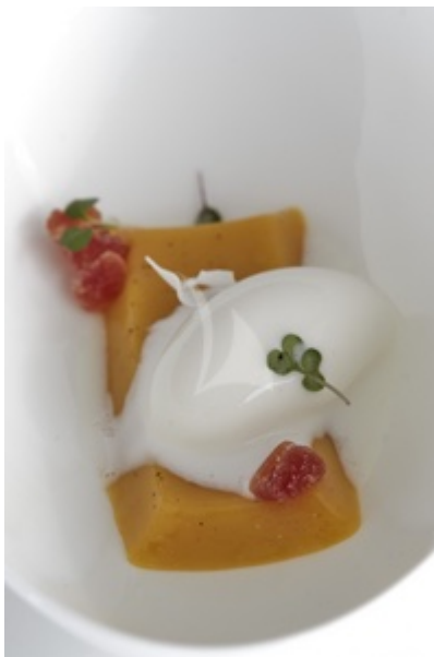
Coconut Ice Cream with a Mango mouse