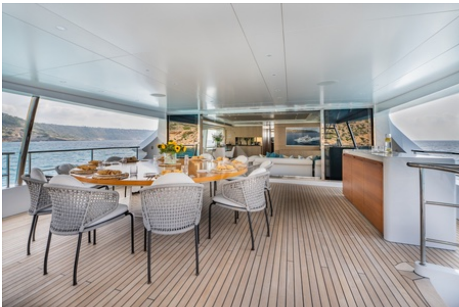
Bridge deck aft dining