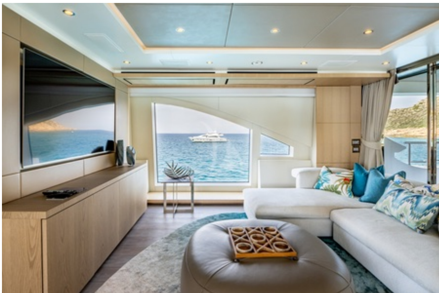
Bridge deck salon stb.