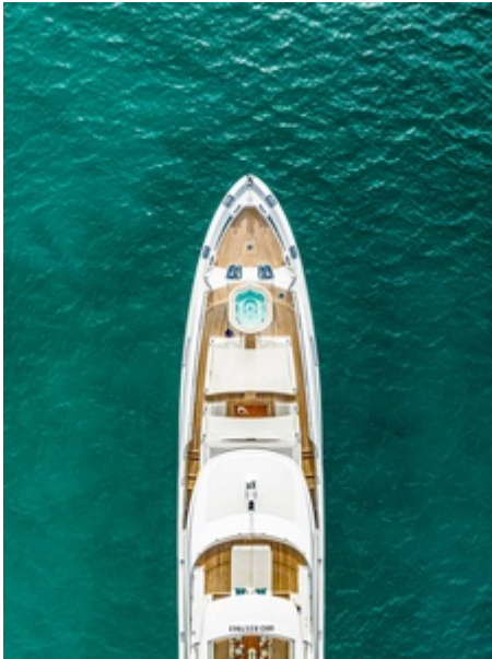
Bow from above