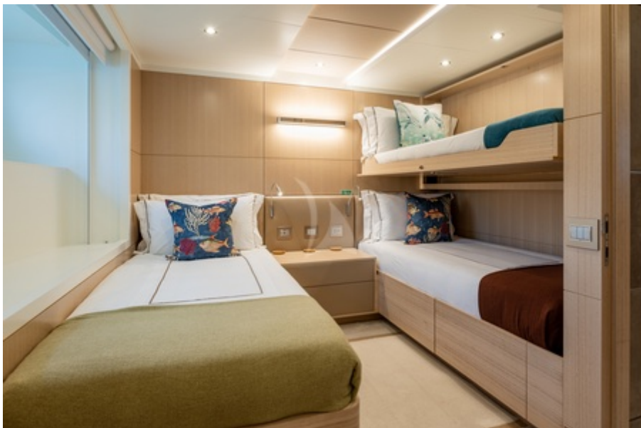
Guest cabin with pullman berths