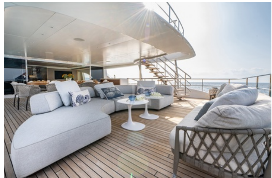
Bridge deck aft seating