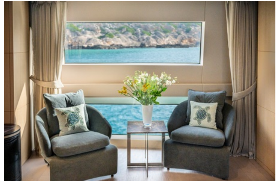
Master cabin seating