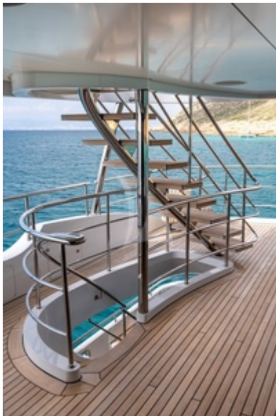
Stairway to sun deck